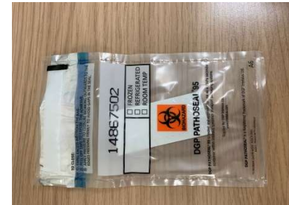
x1 Return Sample Bag