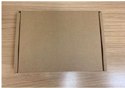
x1 Brown Box