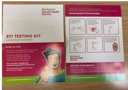
x1 How to complete samples form