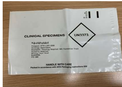
x1 Return Envelope