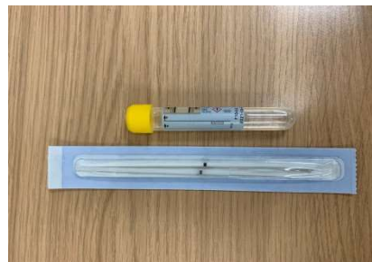
Cobas Tube, Swab (Label Throat, Rectal, Vaginal)