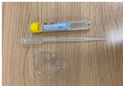
Urine Cobas, Pipette and Collection Pot (Label Urine)