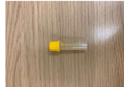
x1 Blood Tube (Labelled Blood)