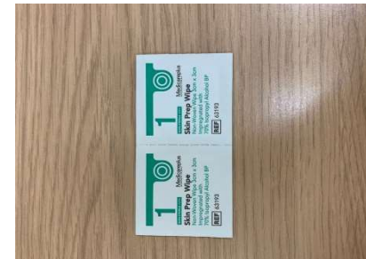
x2 Alcohol Wipes